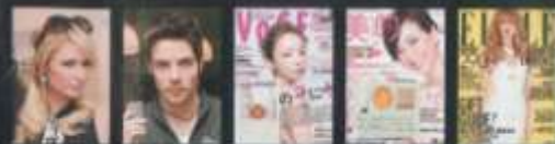
巴黎活劇星 Paris Hilton 高廷演員 Josh Henderson 歐美日的明星都愛用這力牌 Silver Soap

去年到美國工作一星期，機噏地朋友送贈Silver Soap試用裝，回港半年後才記得用，誰知一試便上癮！它外表看似檸檬，拿上手像一般香檳皂，實則是「納米銀潔面皂」。連續一星期用來卸妝潔臉，清潔功效強，洗完臉真的感覺如順毛卜卜，有彈性。