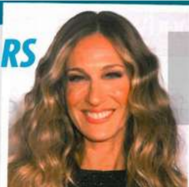
Sarah Jessica Parker