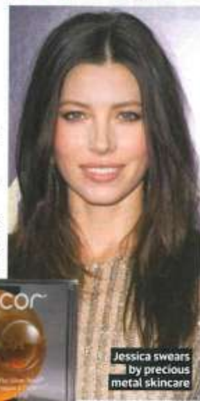
Jessica swears by precious metal skincare

Dubbed a 'miracle multitasker', Cor The Silver Soap already has A-list fans in Jessica Biel, Renée Zellweger and Sarah Jessica Parker, along with hundreds of top US beauty therapists. They all love its one-stop-shop formula for dealing with sensitive skin, replenishing lost collagen, soothing eczema, reducing spots and even removing make-up. Now available in the UK ( corsilver.co.uk ), the soap's secret weapon is silver, one of the best antibacterial agents because it blocks bacteria's ability to transfer oxygen through cell walls. The addition of powerful antioxidant pomegranate means it also smells heavenly.